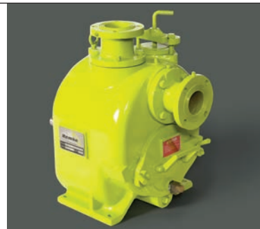
The Remko RT050 Trash Pump

RT Series Pumps are ideally suited for industrial applications including: steel and paper mills, abattoirs, mines, food and chemical processing plants, construction industry, dewatering, trade waste and sewage handling.